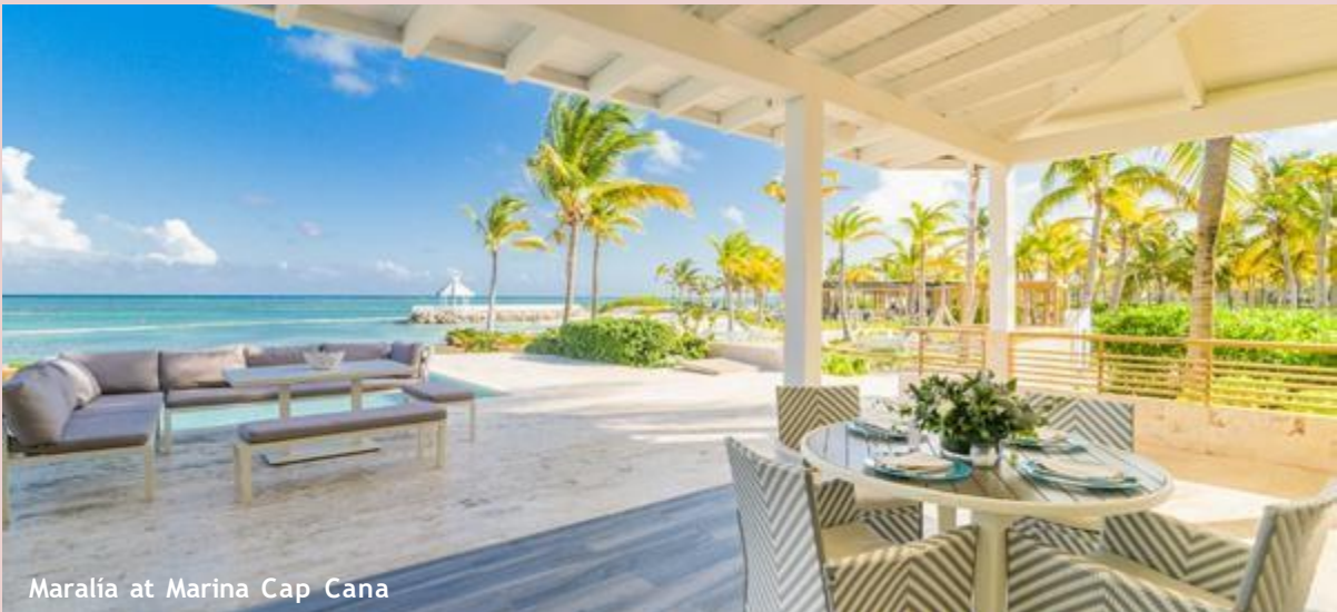
Maralía at Marina Cap Cana

Immerse yourself in the vibrant tapestry of our diverse bar scene, where mixologists craft liquid masterpieces, food trucks serve up delectable pairings, live music perfumes in the ambience and the excitement of the casino beckons. You can head over to one of our locations to make sure your night is all you can talk about the next morning.