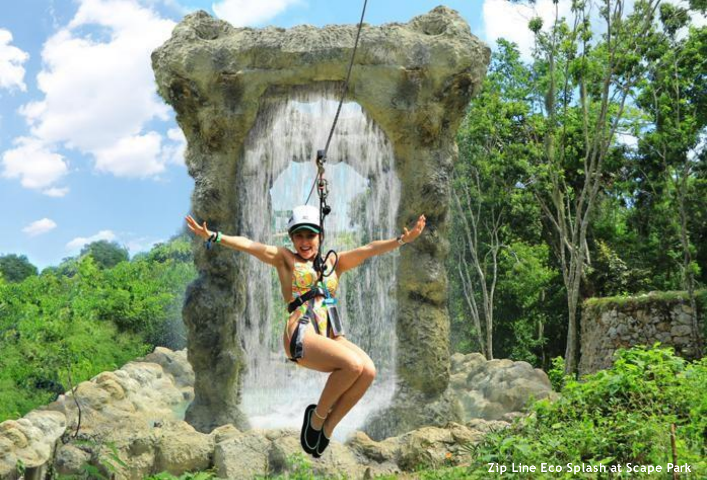
Zip Line Eco Splash at Scape Park