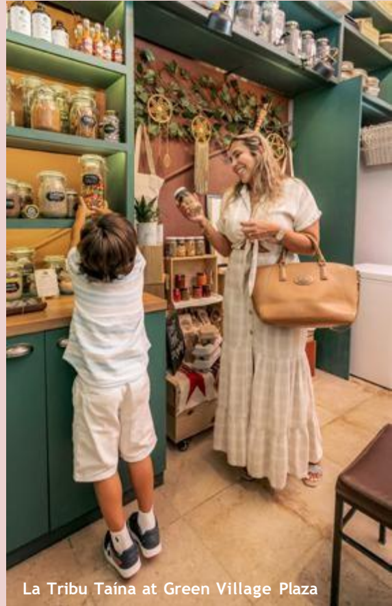
La Tribu Taína at Green Village Plaza