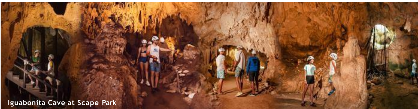
Iguabonita Cave at Scape Park