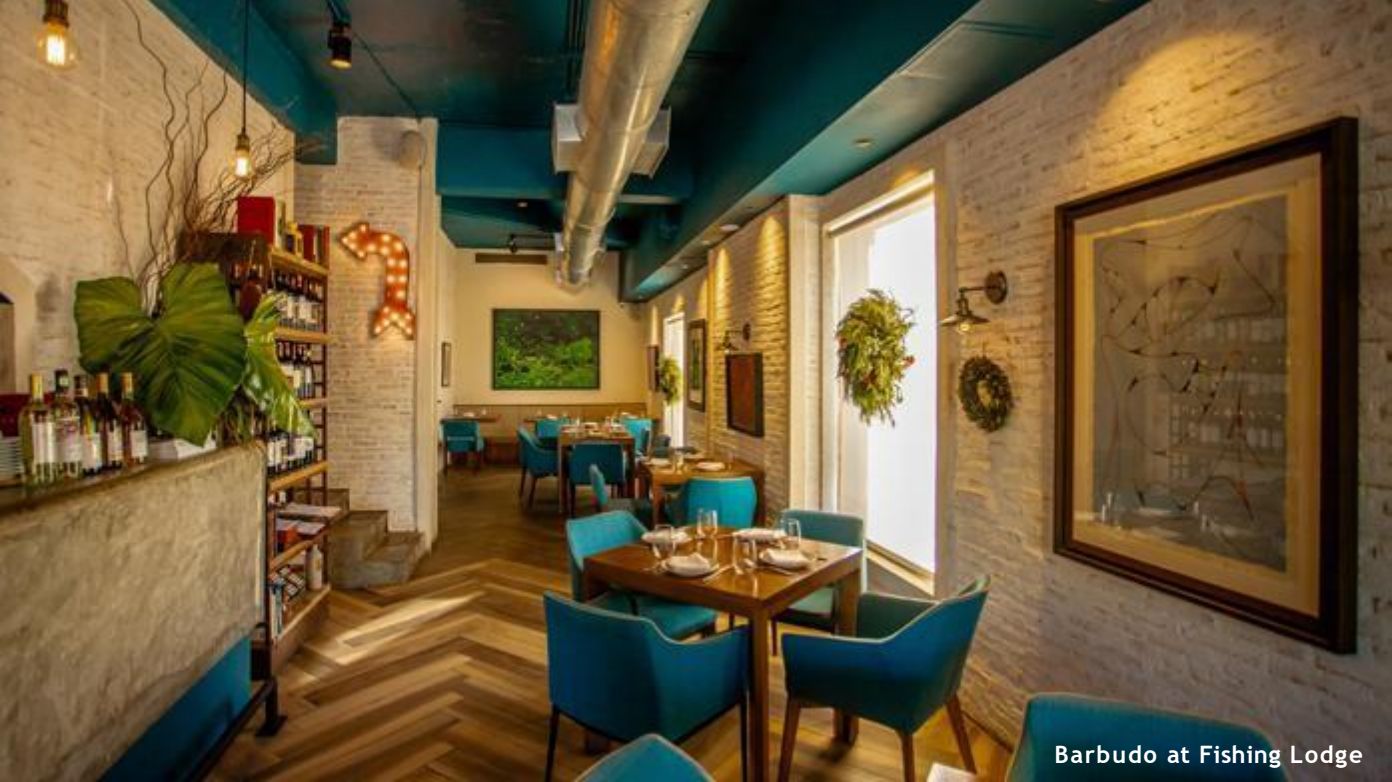
Barbudo at Fishing Lodge