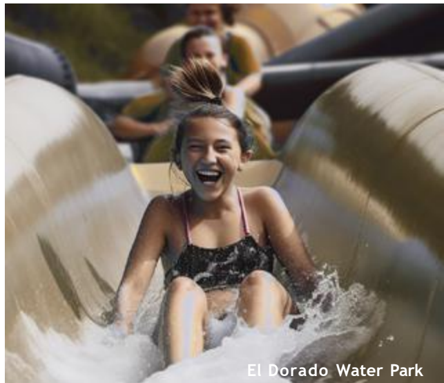
El Dorado Water Park

Not a day will go by in Cap Cana without a little adventure in your life. From biking, to ziplining, to exploring caves and forest, your days will surely be full of excitement.