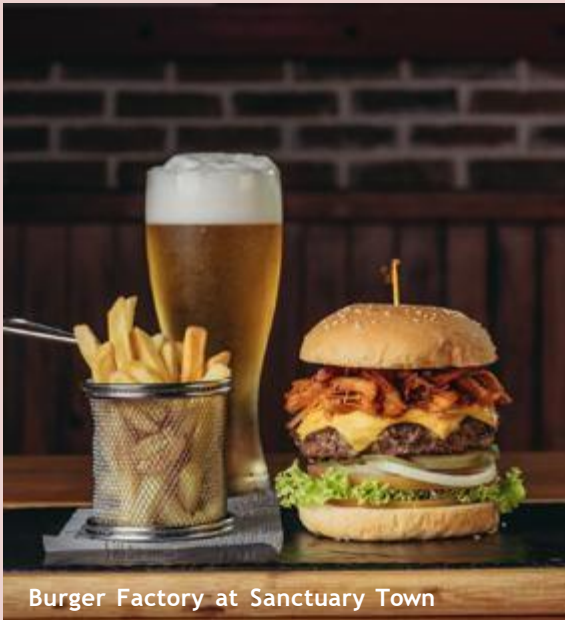
Burger Factory at Sanctuary Town

Hear the sizzle and watch the smoke come off of your plate; that's the kind of action you're looking for in your grilled meats. Luckily, there are plenty of restaurants that offer the best cuts in town.