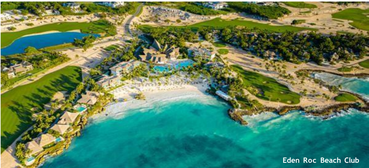
Eden Roc Beach Club

This crystal watered cove is exactly what the doctor prescribed. Uniquely nestled within huge rocks, this blue flag certified beach is as exclusive as it gets.