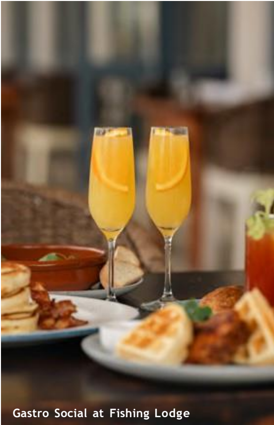
Gastro Social at Fishing Lodge

We've got some go-to spots for brunch and mimosas. If you're looking for an everyday place to casually meet up and enjoy a variety of delicious dishes, maybe some soul food or something more on the pastry side of brunch. Come and explore the tasty treats that our city has to offer.