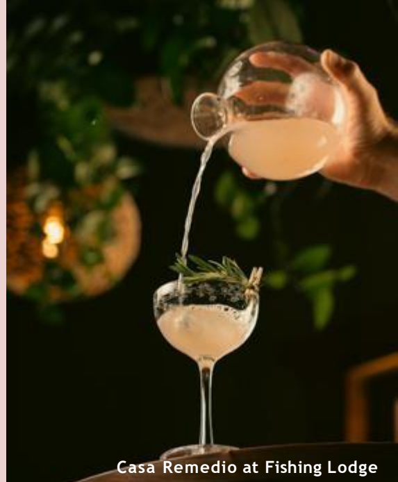
Casa Remedio at Fishing Lodge