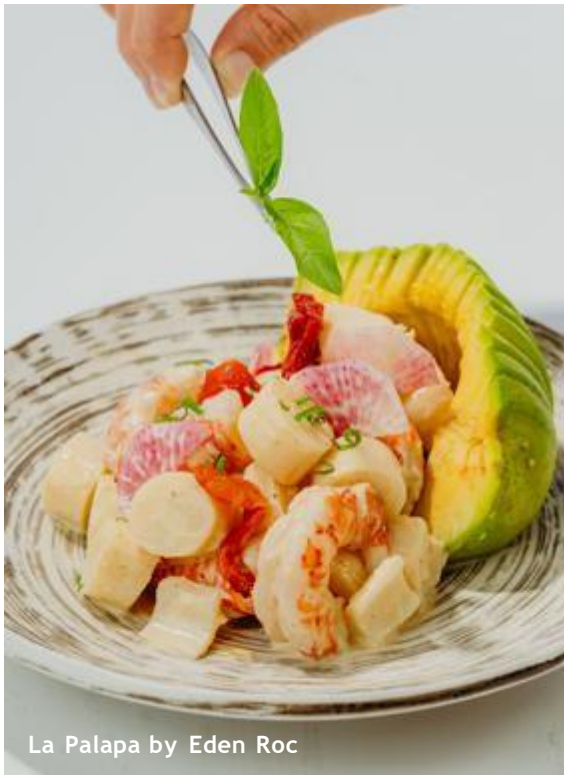
La Palapa by Eden Roc