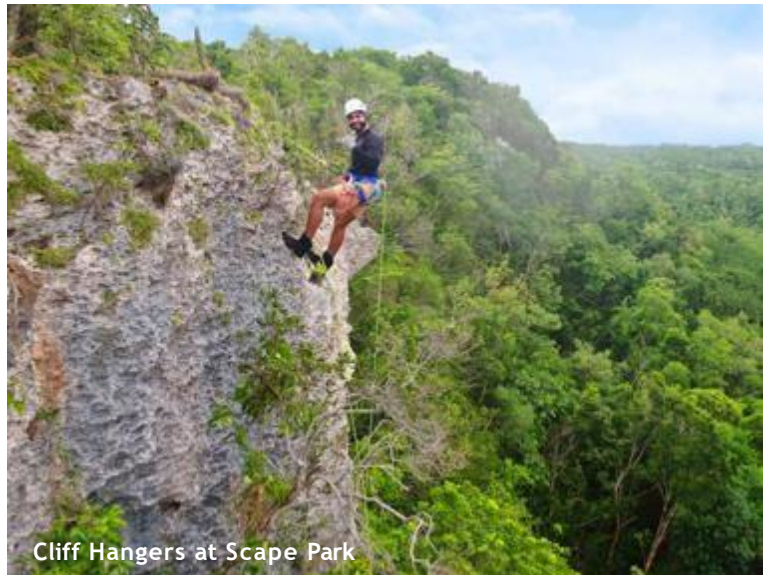
Cliff Hangers at Scape Park