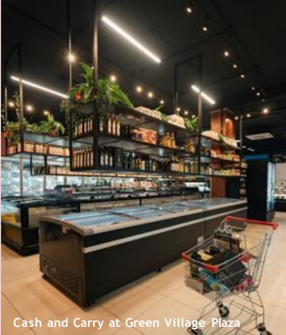
Cash and Carry at Green Village Plaza